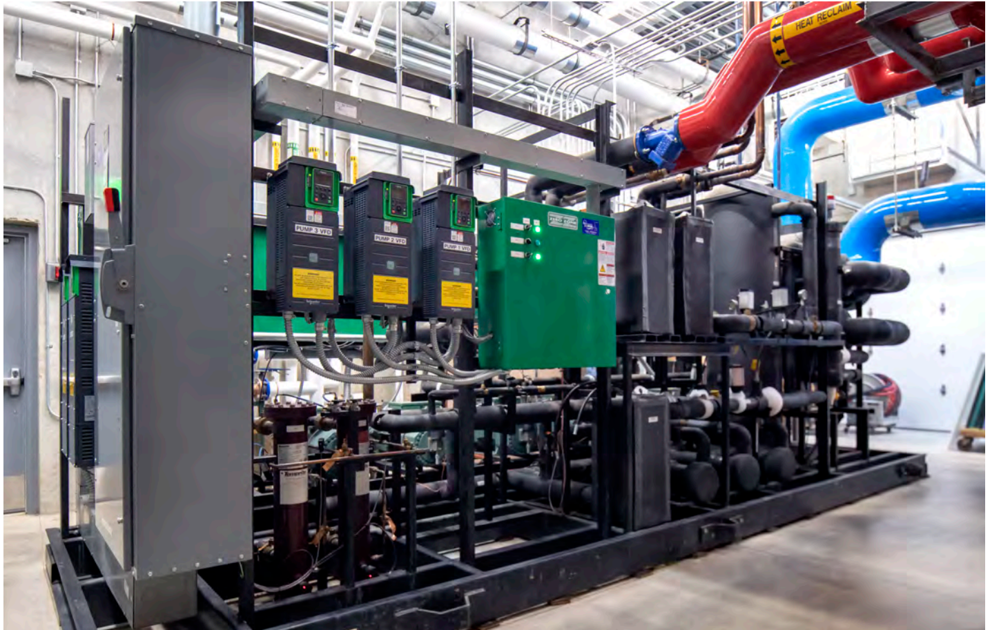
FIGURE 3: System 3 - CO 2 Packaged Chiller System

System 3: CO 2 system with flooded plate chiller and adiabatic condensing/cooling (FIGURE 3).