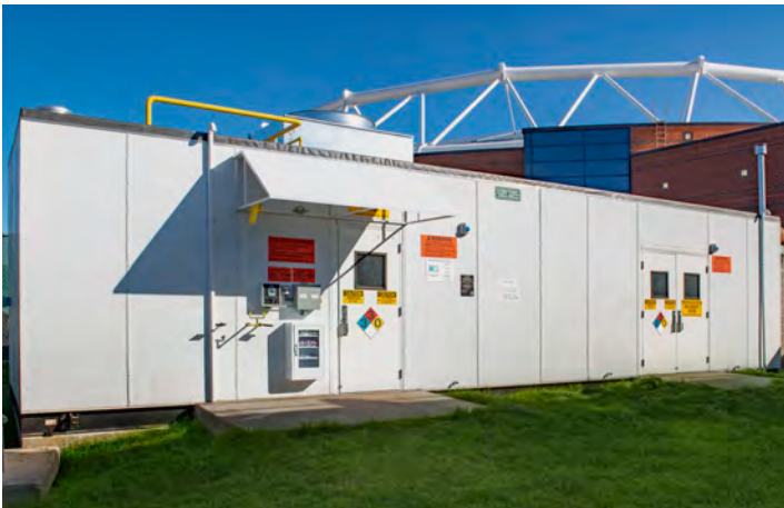
FIGURE 1A: System 1 - Ammonia Packaged Chiller Machinery Room, Exterior