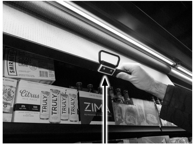
FIGURE 2: If Applicable, Orientate So Magnet Can Attach to Case