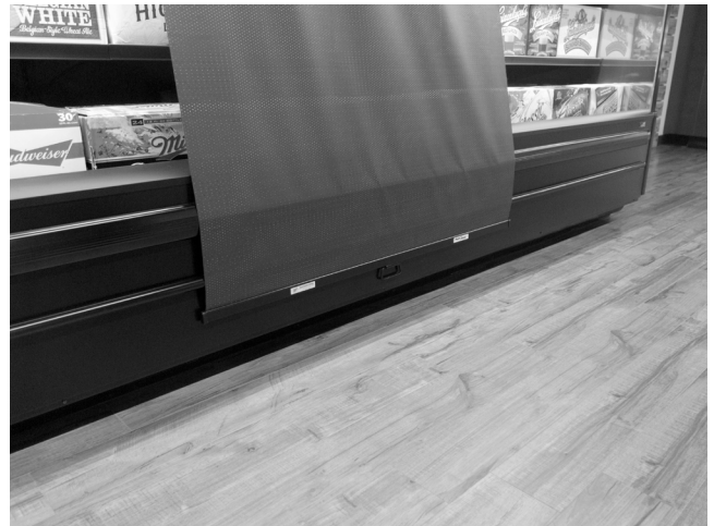
FIGURE 4: Night Curtain Pulled Down