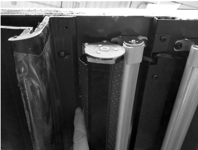
FIGURE 3: Tip Night Curtain Forward and Twist the Back into the Bracket