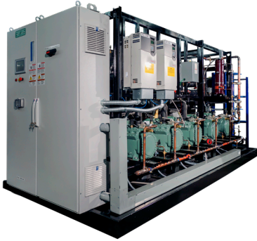
CO 2 Transcritical Booster System