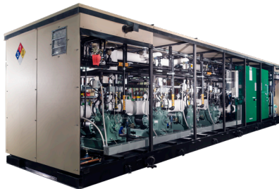
NH 3 / CO 2 Cascade Outdoor Parallel System (OPS)