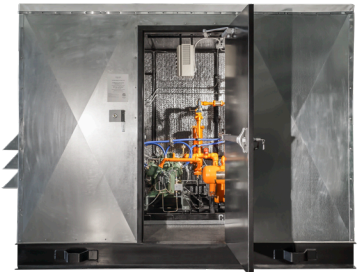
Low Charge NH 3 Water-Cooled Chiller Custom Electrical Mechanical Center (CEMC)