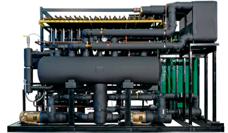
CO 2 Subcritical System