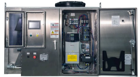
Integrated Power & Motor Controls Advanced Microprocessor Controls