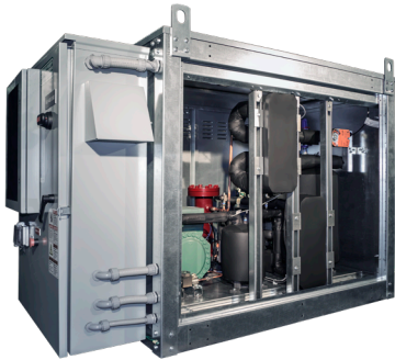
Edge™ XT CO 2 Water-Cooled Condensing Unit