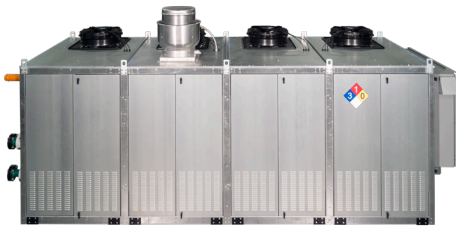
Edge™ XT Low Charge NH 3 Air-Cooled Chiller