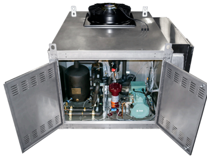
Edge™ XT CO 2 Air-Cooled Condensing Unit