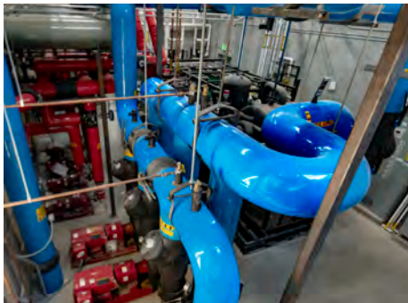
CO 2 Chiller