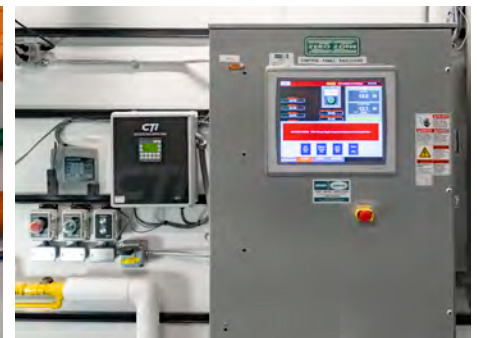
Chiller Control System