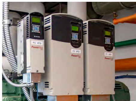
Variable Frequency Drives (VFDs)