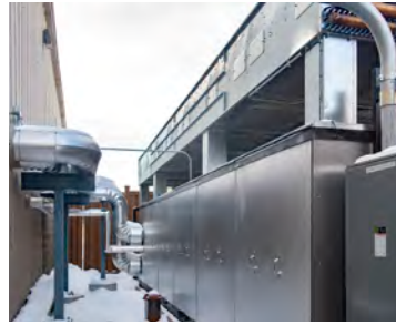
OPS Weatherproof Housing

Our chillers are customized to fit in your mechanical room or as an outdoor parallel system (OPS) in a weatherproof housing. We also build custom electrical mechanical centers (CEMCs) that are structurally sound exterior mechanical rooms, perfect for a smooth retrofit. Every configuration is designed for ease of installation and service accessibility.