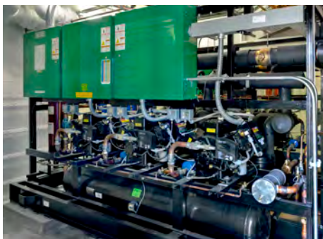
Synthetic Refrigerant Chiller