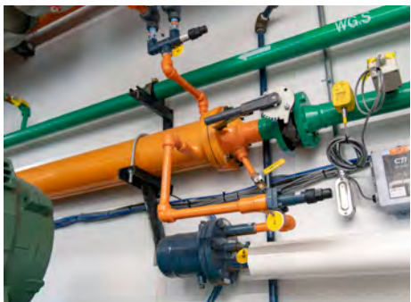
Heat Reclaim System