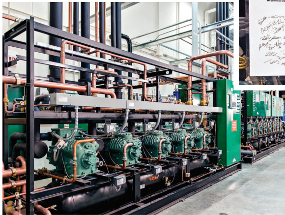
Medium Temp Industrial Rack

of refrigeration components that are cobbled together on-site to get the job done. It’s a nice package and you can tell just looking at it. The factory people take pride in it and even sign off on the equipment with each individual person putting their names to it. I mean you don’t see that very often these days.”