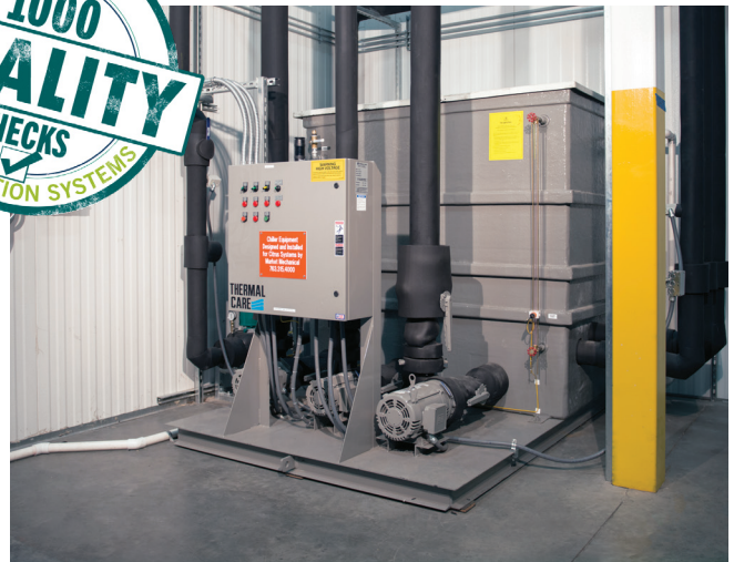
Chilled Glycol Pump Package

The Refrigeration Systems Division of Zero Zone, Inc. has been a leader in refrigeration systems and electrical control innovations for over 40 years. We maintain our position by listening to our customers, both contractors and end users, and continually reinventing our products through state-of-the-art engineering, custom-tailored to each application. We also put our products through over 1,000 precision quality control checks to assure uncompromised system integrity. Our systems are legendary for their ease of installation and their convenient service access, providing excellent value in a reliable, energy-efficient package.